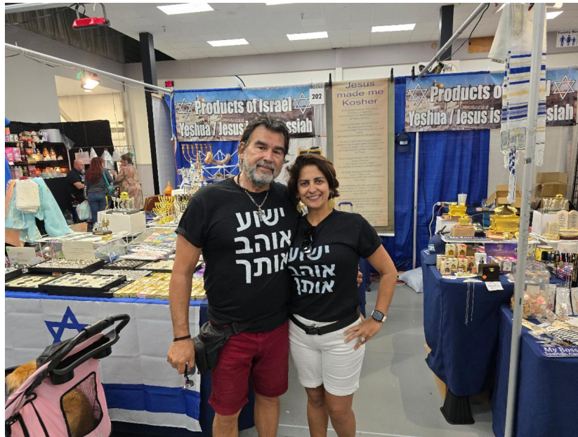
Volunteers from a local Messianic Congregation called "Shores David" helping us out for a few hours. Their shirts say in Hebrew "Jesus Loves You."

* A Jewish couple in their 70s from New York stopped, and we had a good conversation. She knew exactly the high school I went to in New York City, so that helped the conversation flow. She listened, but the husband was more interested and said, "Give me whatever literature you have," and he took it all.