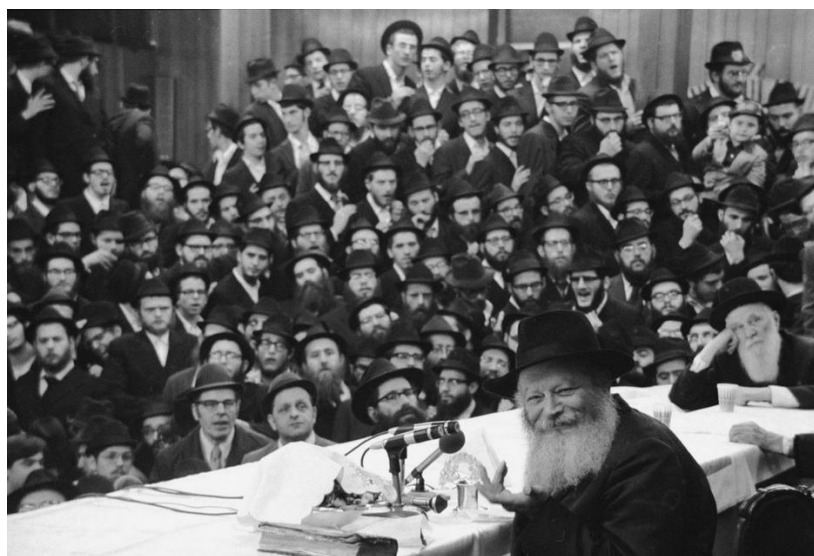
Rabbi Menachem Schneerson whom some considered the Messiah

Last month, there was a very large gathering of Jewish youth in New York City to help rally against anti-Semitism. As part of the trip to New York, the youth went to visit the grave of a very famous Jewish man, Rabbi Menachem Schneerson, in Queens, NY. In ultra-orthodox circles, many still view him as the Messiah, although he has been dead for almost 30 years now. He was renowned for his teachings, piety, and simplicity.