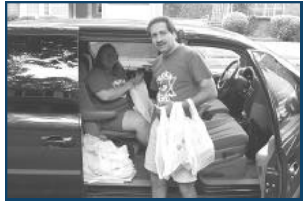
"Giving out the Bread of Life." (the gospel, "Book of Hope")

into basically 52 parts and read through every single year. No matter where they are in the world - they do not forget the Word of God. (Unfortunately, most Jews do not read the scriptures at home though - that's another story.) We have tons of Bibles in America. Let's make sure that we feed ourselves each day.