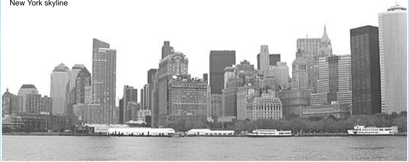
New York skyline

to the Lord and to promoting His Kingdom, you get a sense of accomplishment and joy that nothing compares.