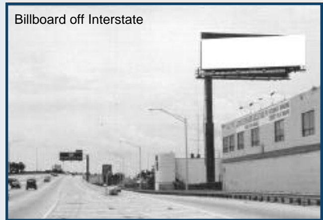
Billboard off Interstate