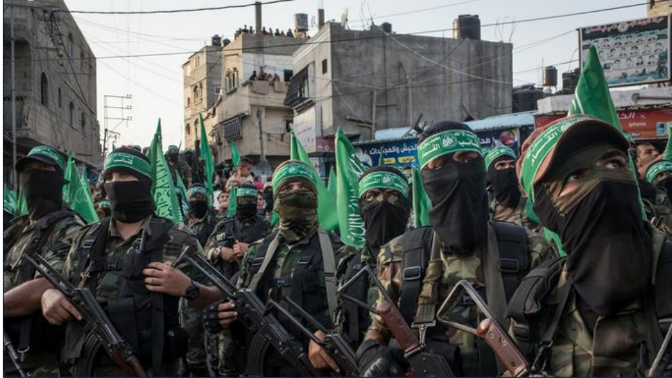
Hamas in earlier times

Sadly, over 240 people (mostly Palestinians) lost their lives in this short war.