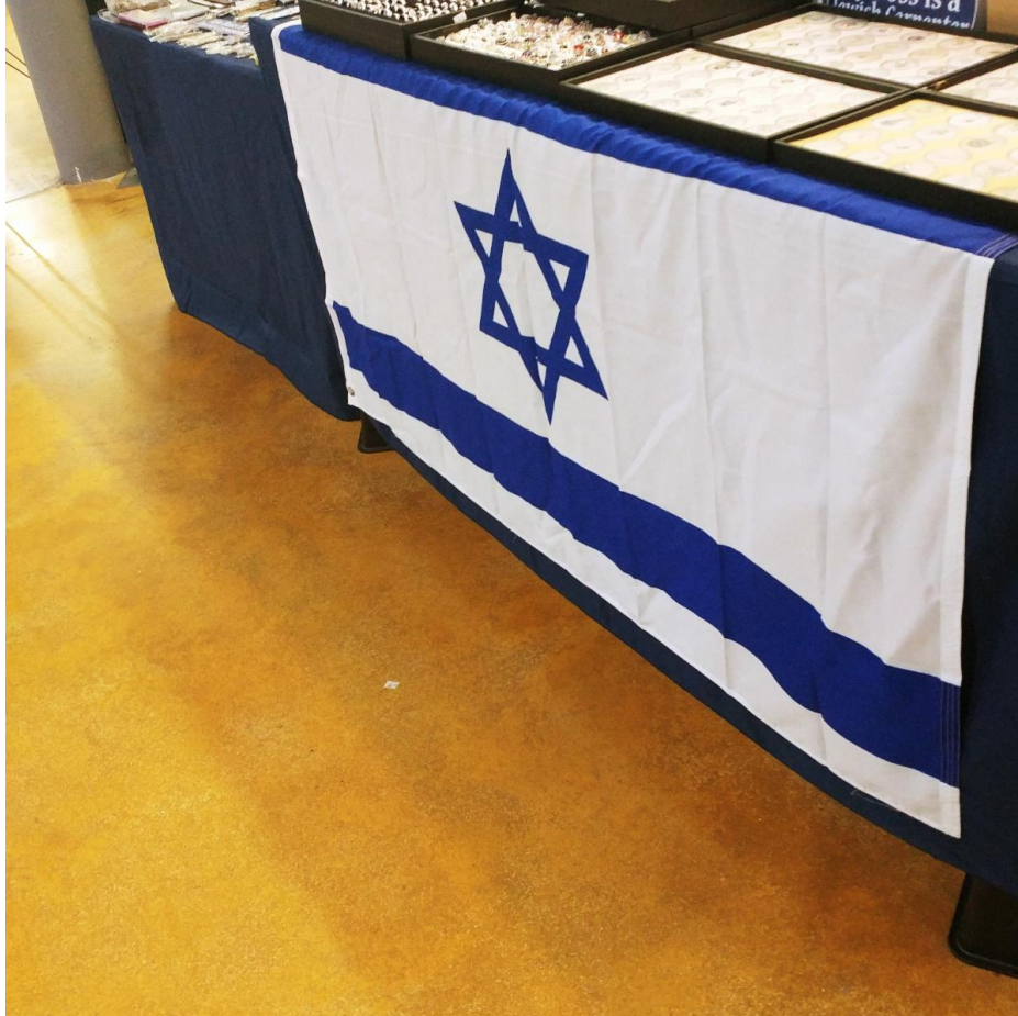
Front of our table at our booth

We had many more Jewish interactions over the 17 days.