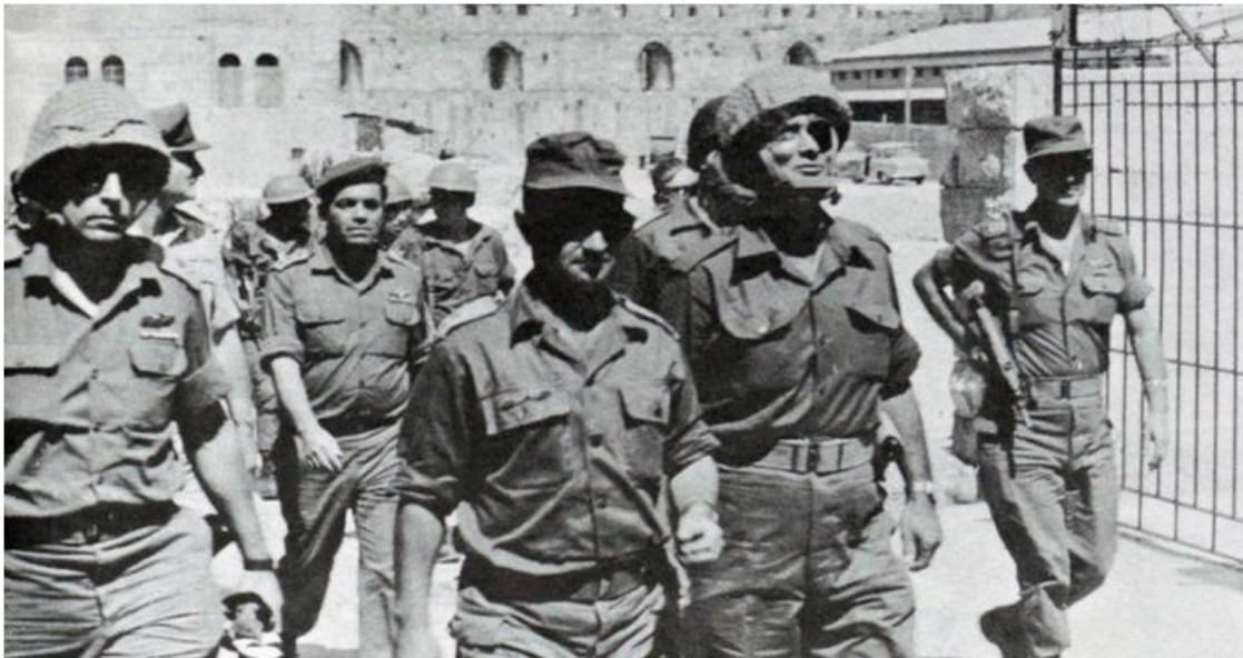
Israeli soldiers retake Jerusalem during the Six-day War in 1967

Even those of you who do not follow world news have probably