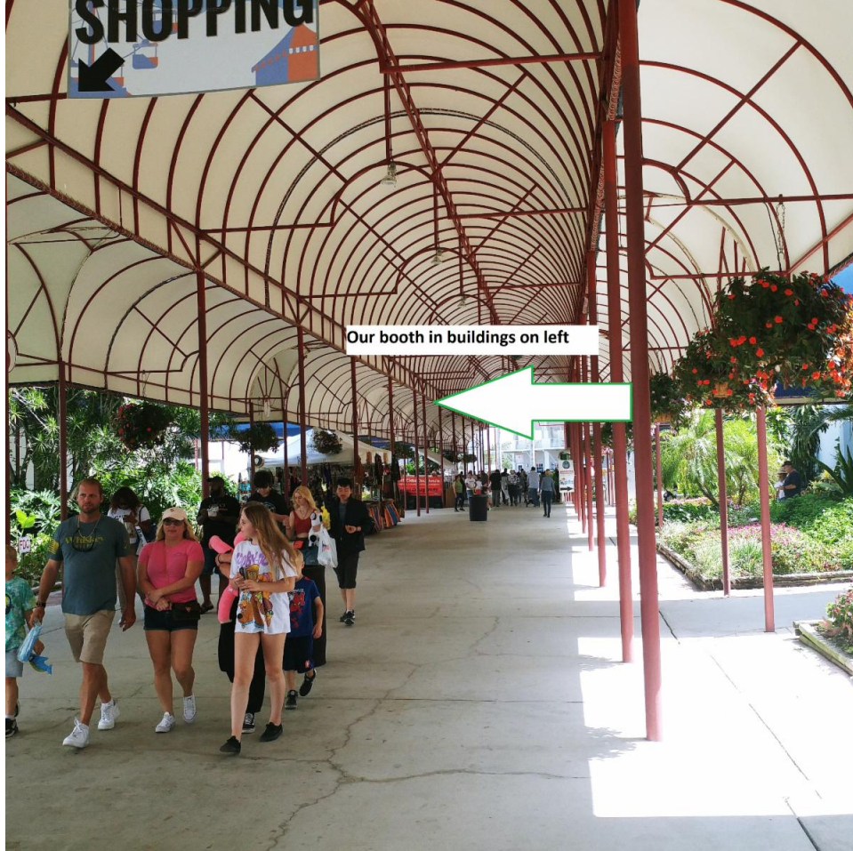
Above: Our booth was in the building on the left

Last month we had our South Florida Fair booth up for 17 days. While it is one of the smallest Fairs that we do, it is in a very Jewish area which makes it worthwhile.